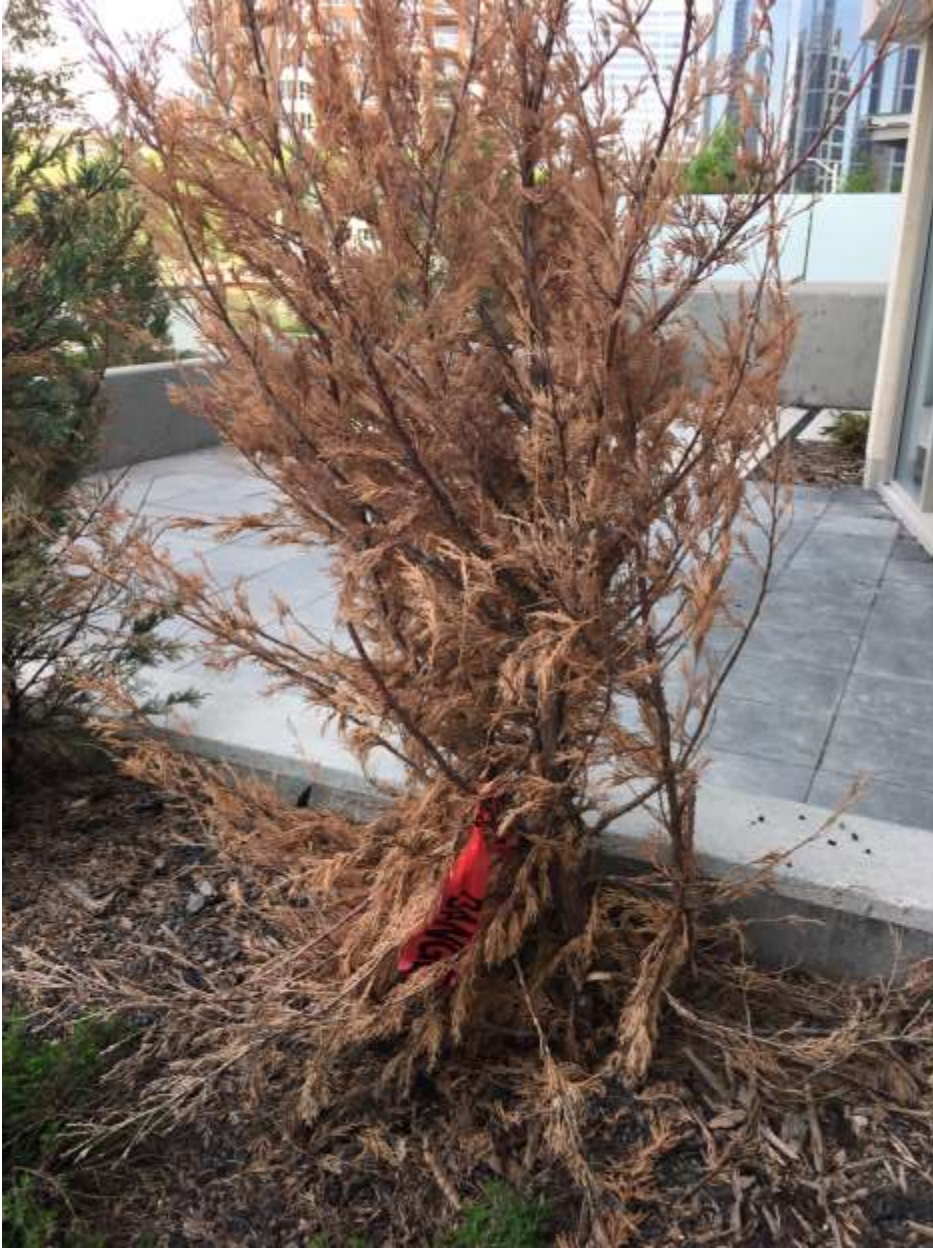
Dead plants throughout the property.