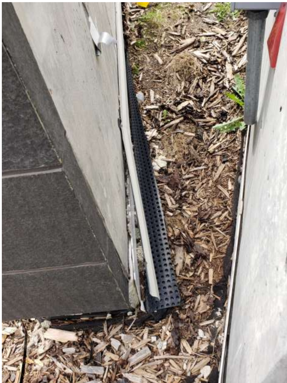
Water screen broken.