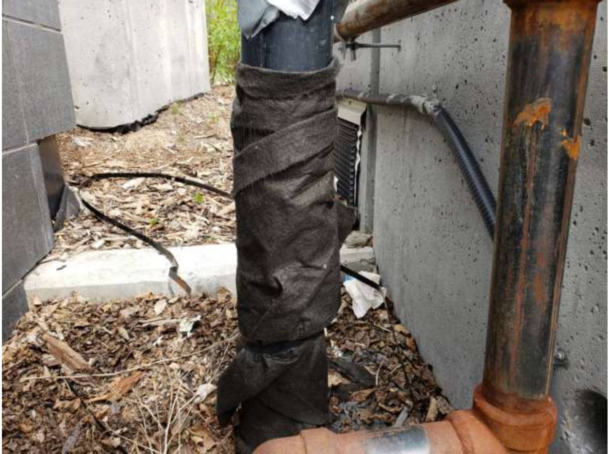
Rusty pipes, black tarp material and more duct tape all exposed on the bulding.