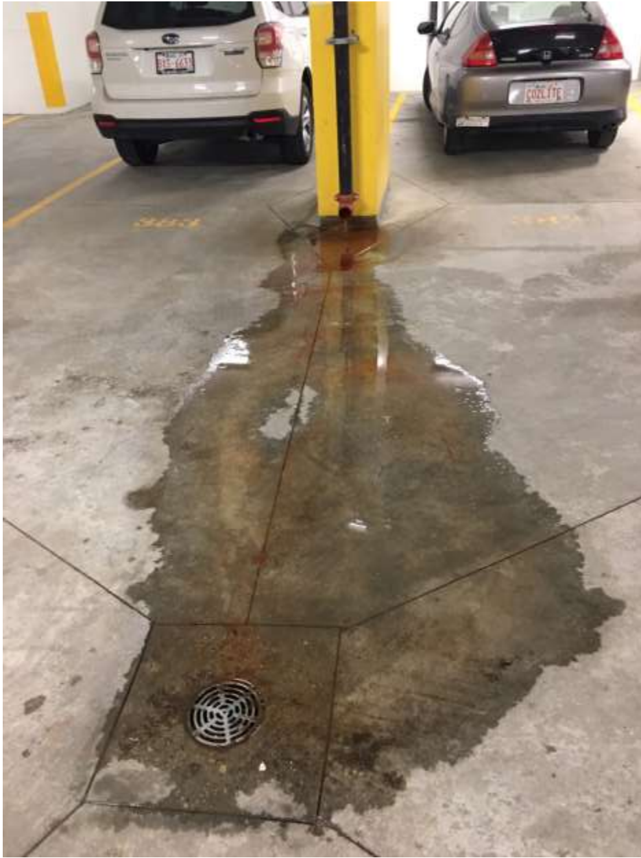
Water on P4 beside residents parking stalls.