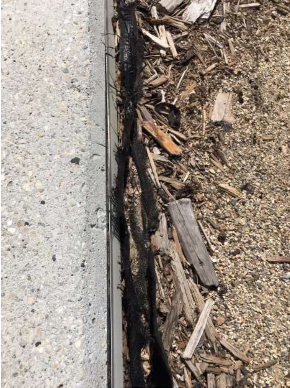
Black material torn up and exposed.