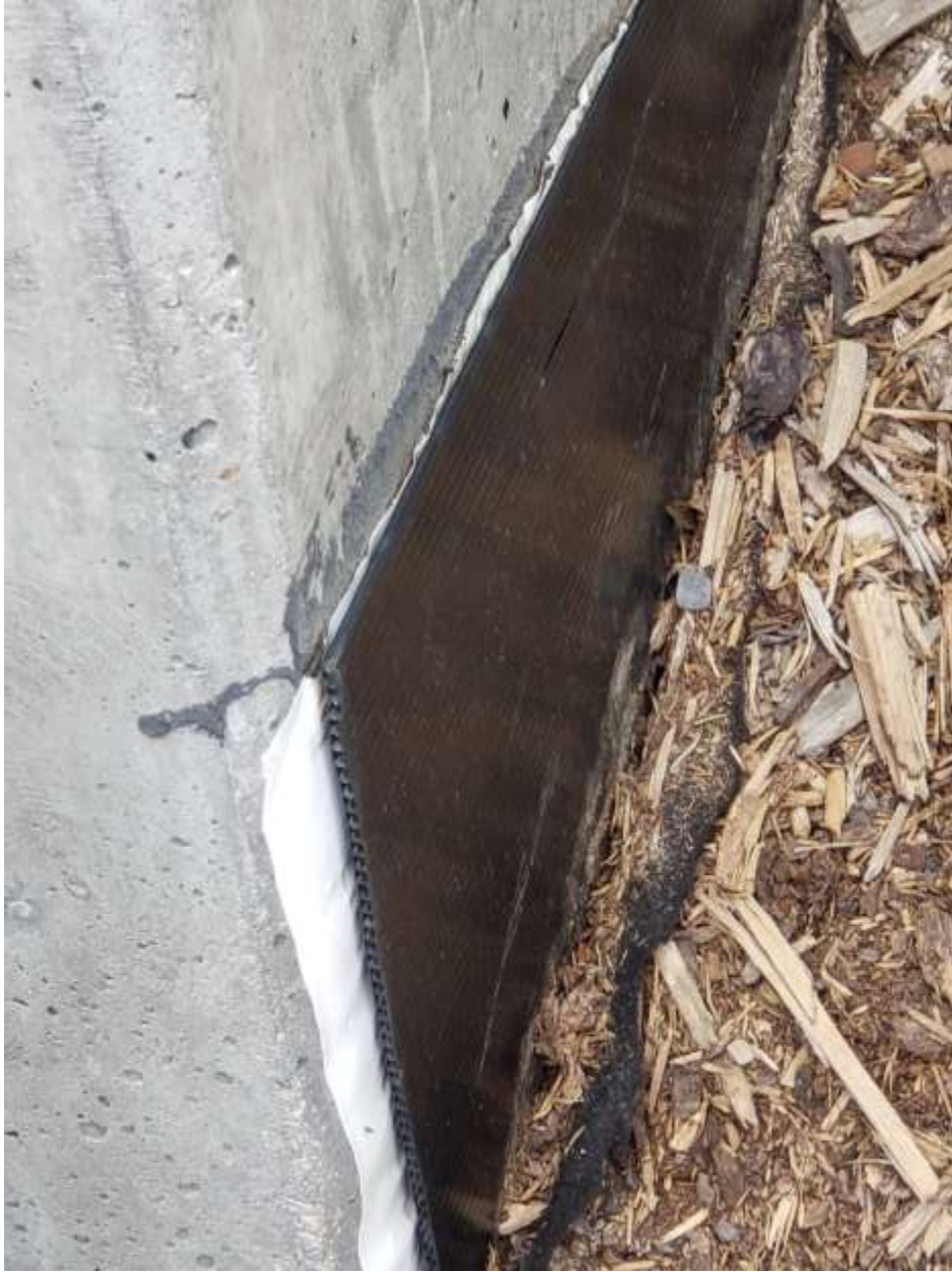
Black plastic that is exposed on the side of the building.