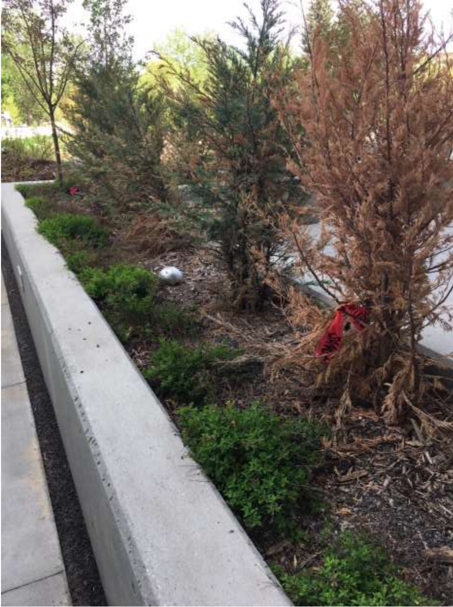
Poor landscaping, dead tree.