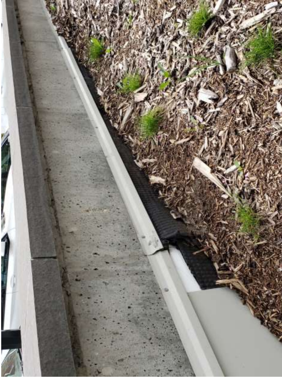
Poor finishing, materials exposed.