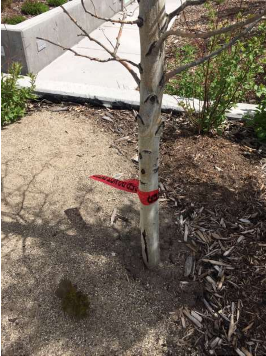
Landscaping. Dirt, dead tree, red tape.