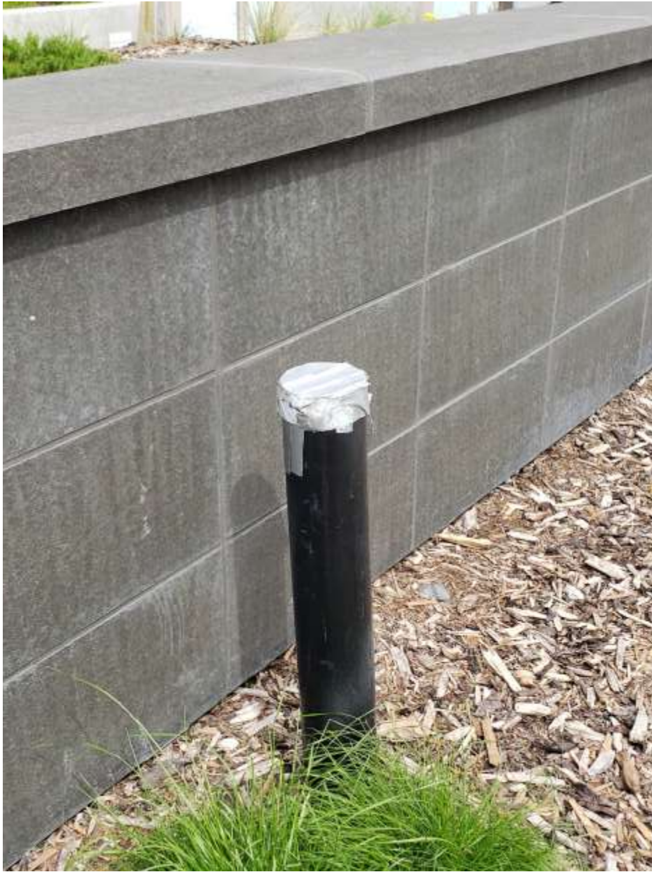
Duct tape to cap off pipes.