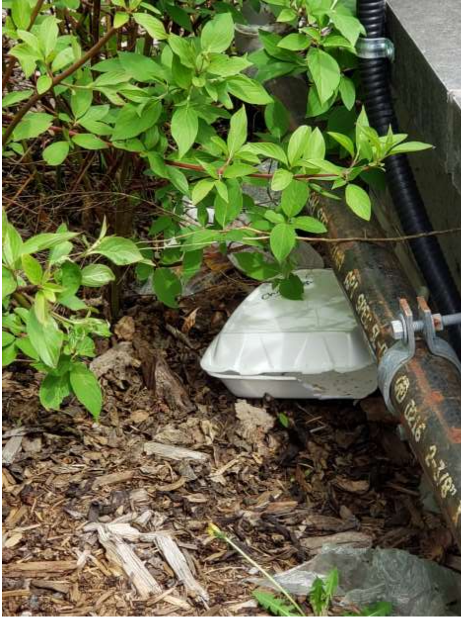
Rusty pipes exposed and garbage that doesn't get cleaned up.