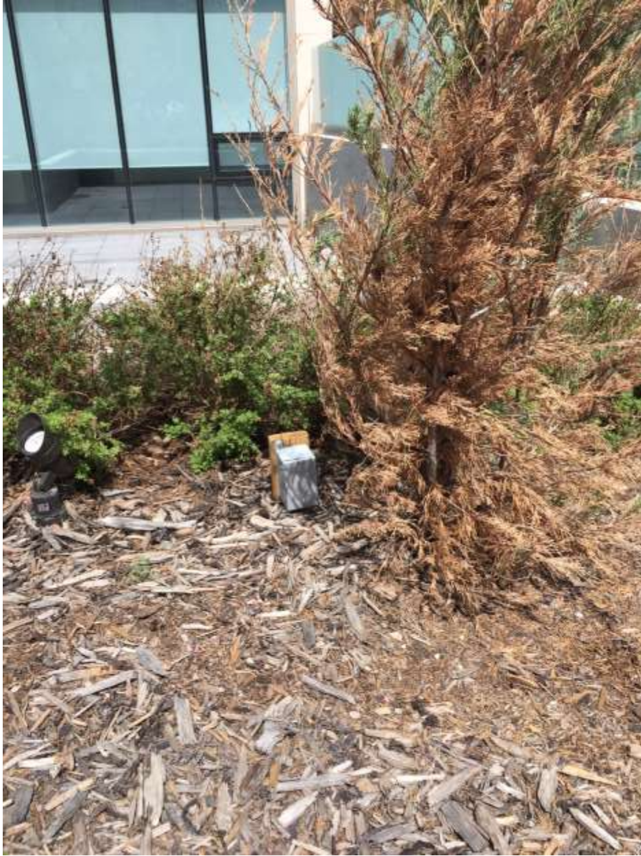
Electrical outlets attached to 2x4 piece of wood.