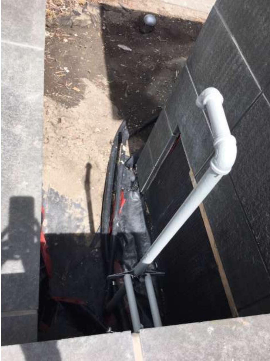
Pipe and tarp exposed.