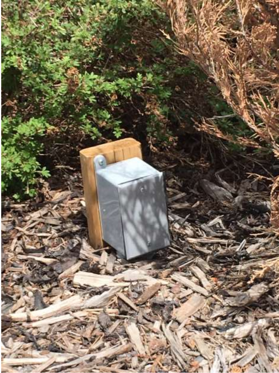
Electrical outlet attached to a 2x4 piece of wood. They are concerned this will rot in time, and they don't think it looks right.