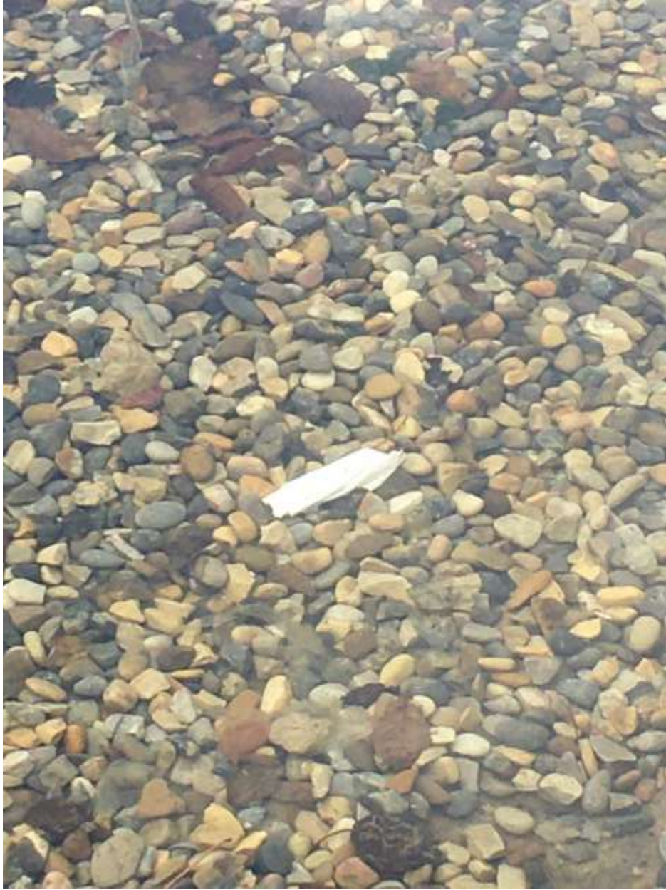
Piece of garbage that is in the outdoor water pond. Has been there for a long period of time.