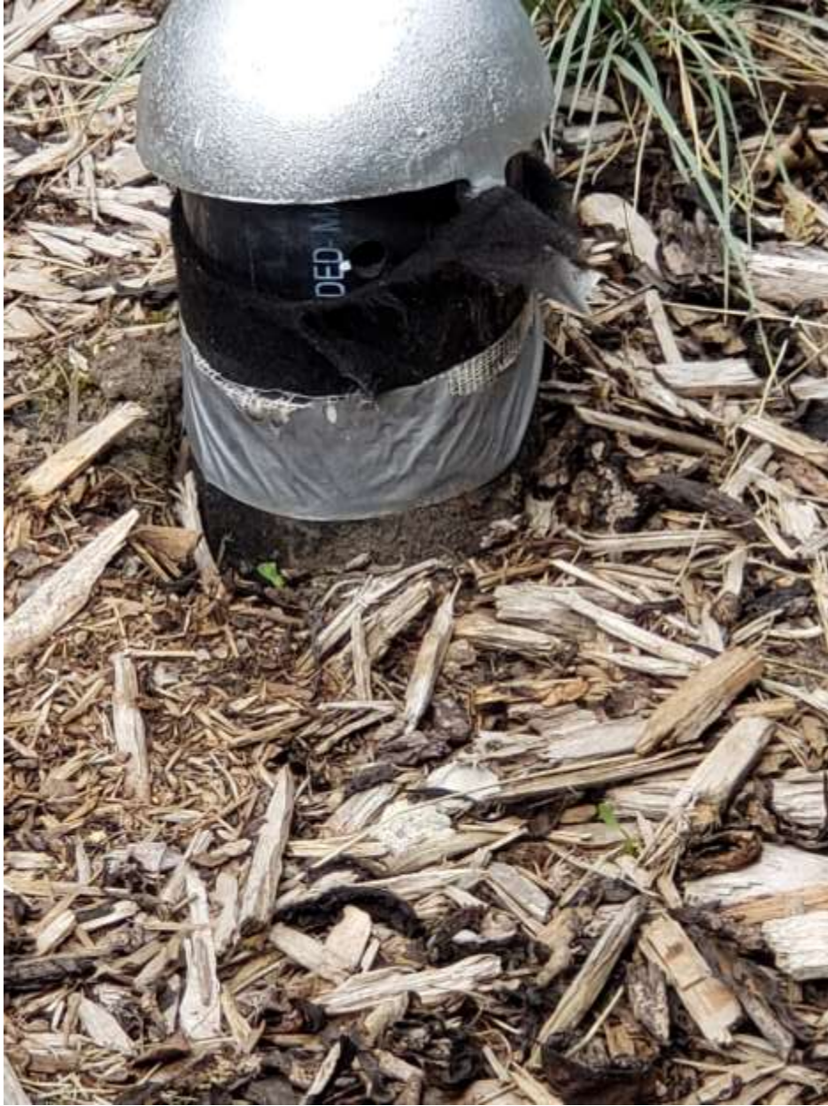
Duct tape on exterior finishings throughout the property.