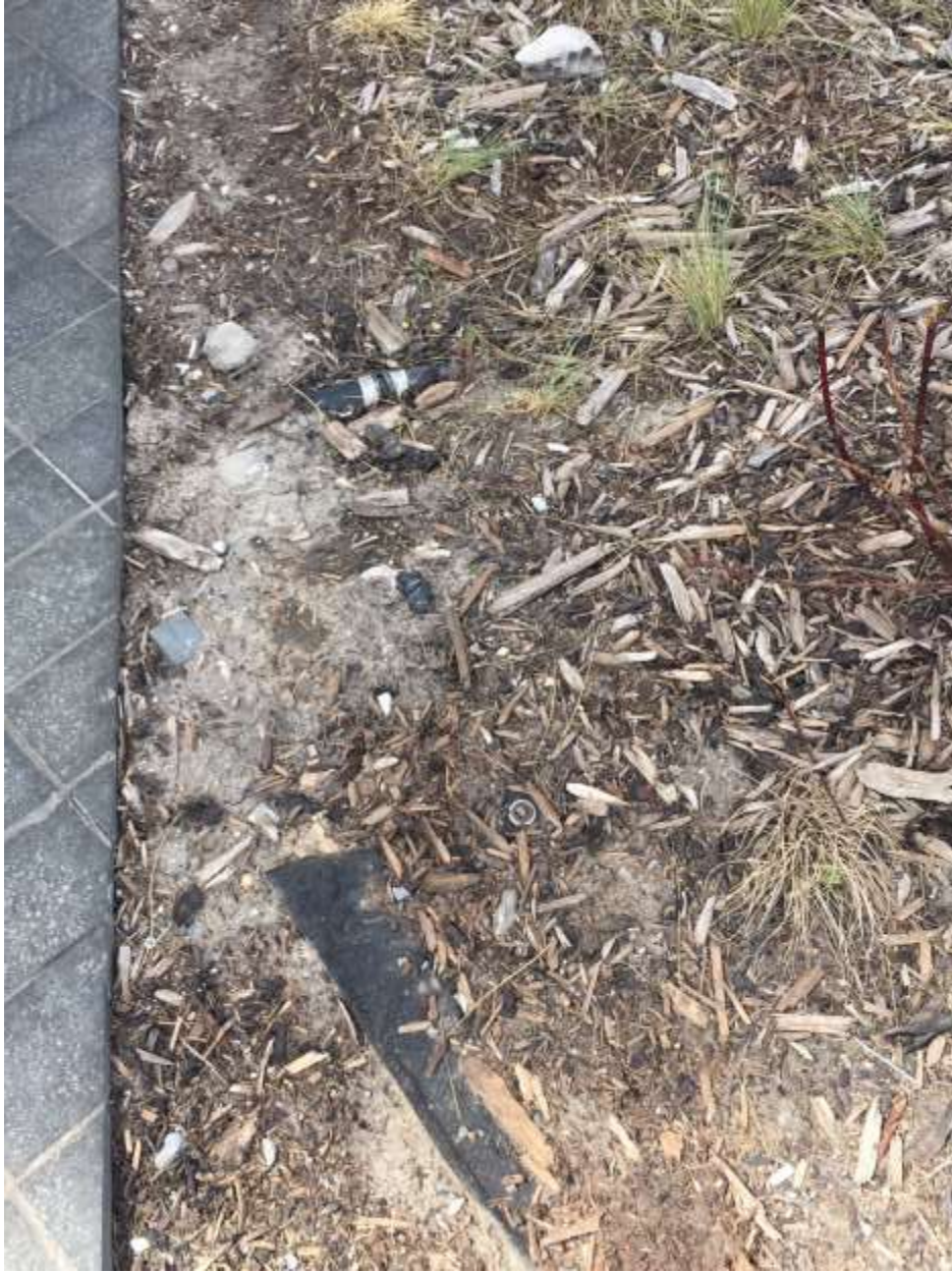
Poor landscaping on the grounds.