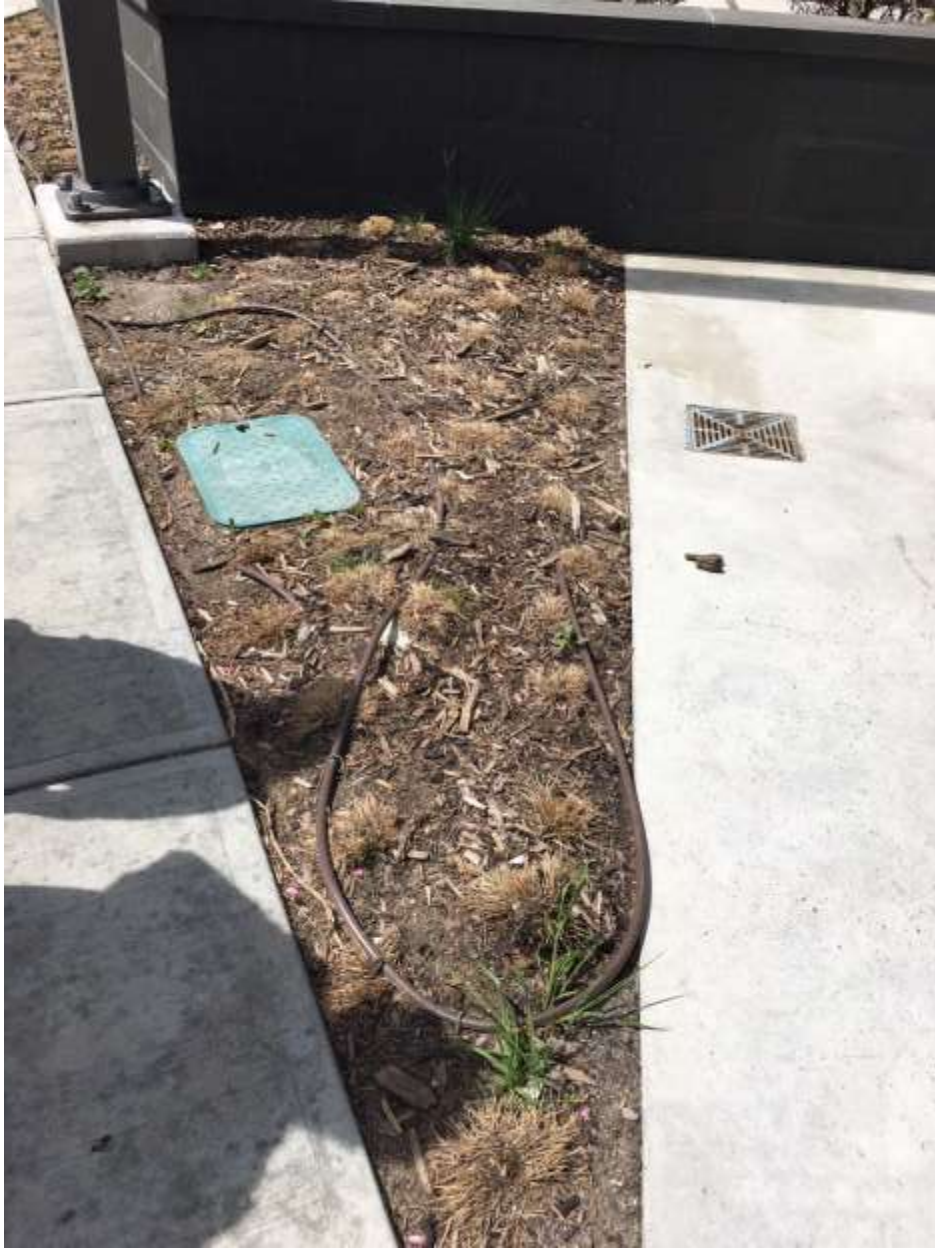
Piping Exposed. This is on 1 st Avenue from the street when you walk by the building. They don't feel this is a good representation of a luxury building.