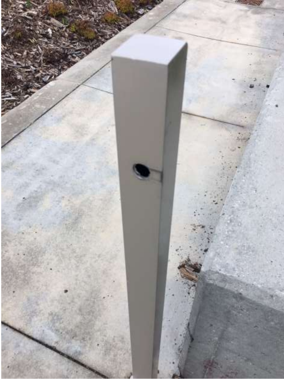
Unfinished gate holes throughout the property.