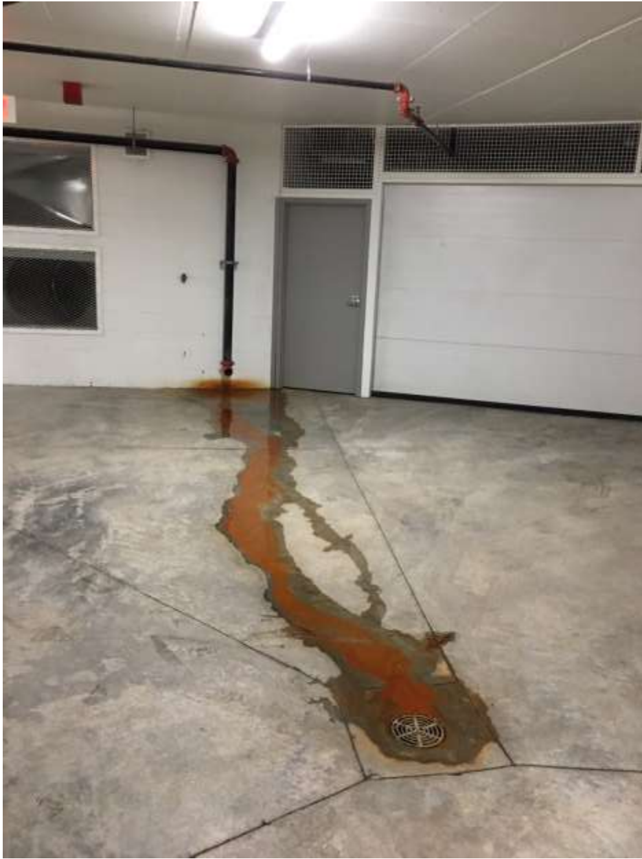
Rusty water on P4.