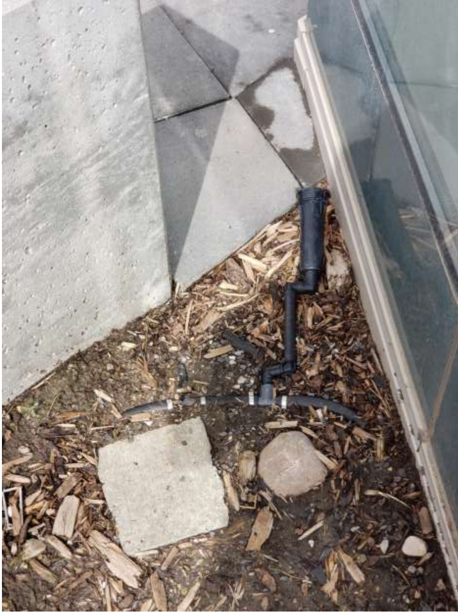
Water sprinkler broken for a long period of time.