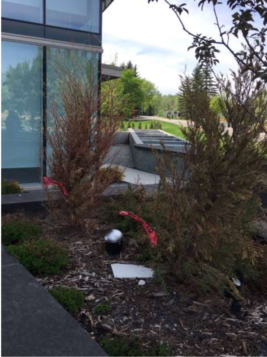
Dead trees in many areas and the red tape left on plants throughout the property.