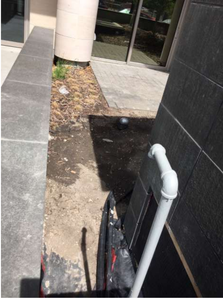
Outside front entrance of the building. Pipes and tarp exposed and no landscaping, just dirt. Not the best first impression of a luxury building.