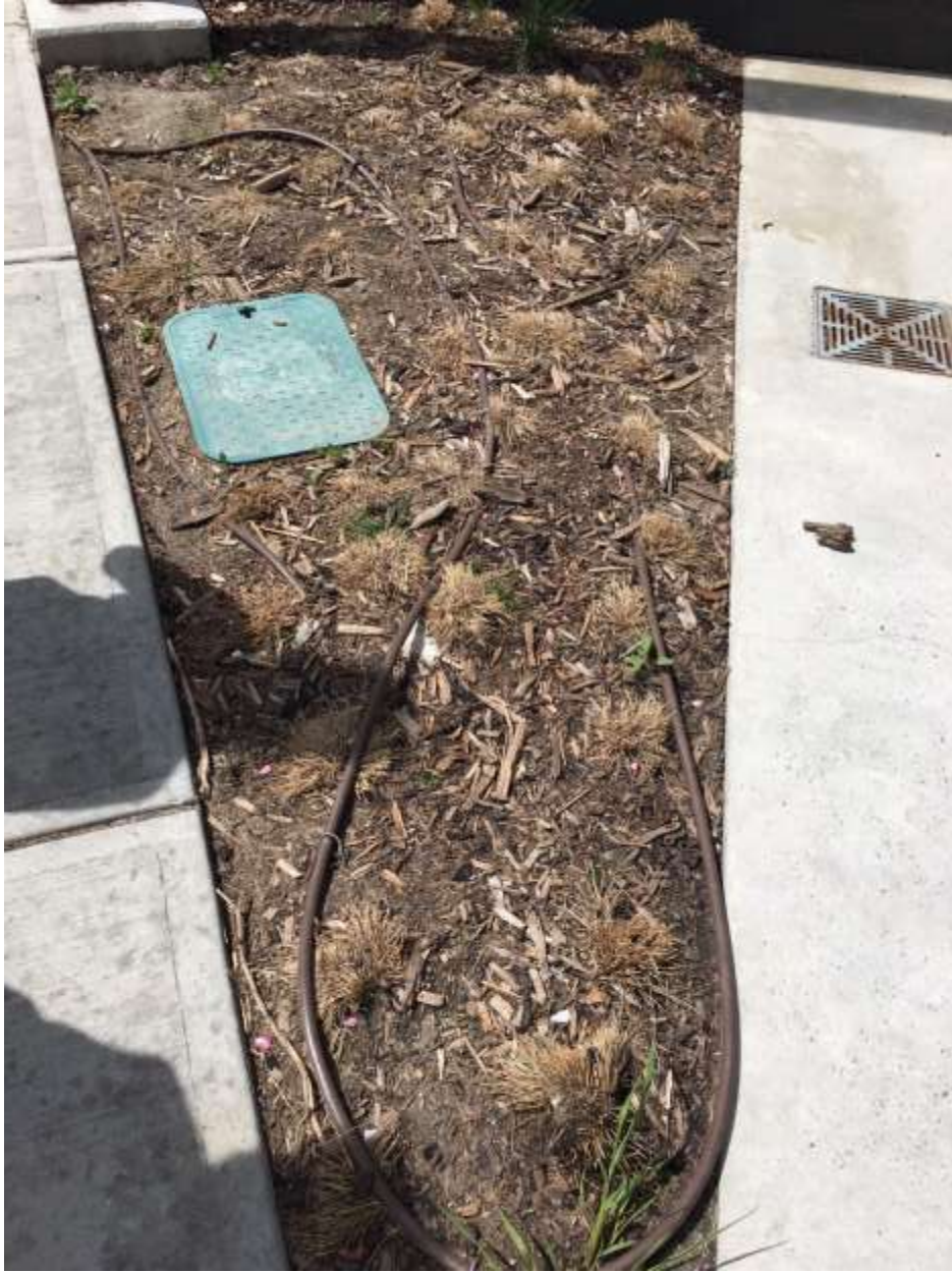
Piping exposed from 1 st avenue sidewalk.